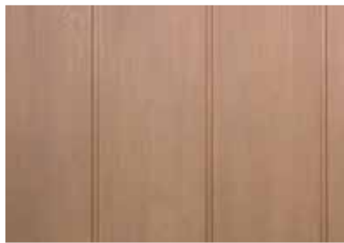
Cedar / Exterior water based varnish stain