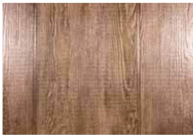
Spotted Gum / Exterior water based varnish stain

Stratum™ is a vibrant and innovative alternative to traditional weatherboards and now with a timber texture you have the best of both worlds – the longevity of Fibre Cement and the character of timber. The deep shadow line creates a contemporary aesthetic with two groove options to choose from.