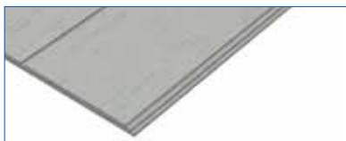
A vertically grooved panel with 150mm between the grooves