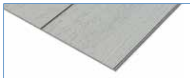
A vertically grooved panel with 400mm between the grooves