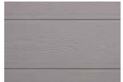
Windspray / Acrylic water based paint