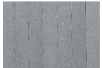
Woodland Grey / Acrylic water based paint