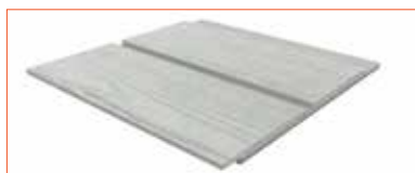
A 300mm wide plank with a 16mm groove in the centre giving the appearance of 2 thinner planks