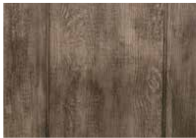
Charcoal / Exterior water based varnish stain