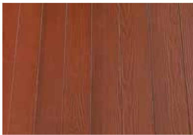
Merbu / Exterior water based varnish stain

Duragroove™ Wide and Extra Wide Profiles add flexibility to the design of any facade. The shiplap joint makes it easier and faster to install and our offer of 3 sheet sizes helps reduce costly wastage.