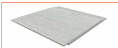
A 300mm wide plank